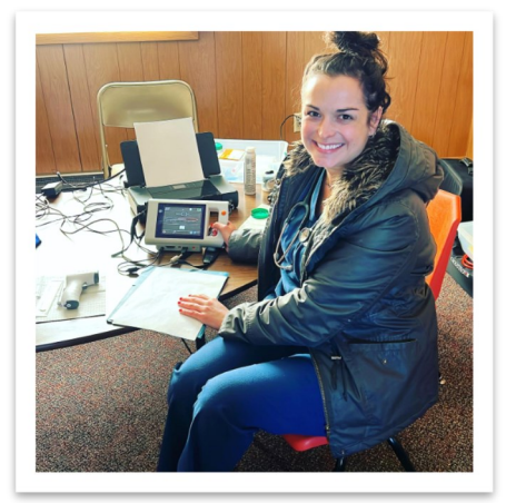
Preschool Screening in Munich